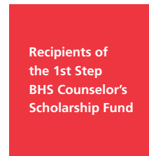
Recipients of the 1st Step BHS Counselor's Scholarship Fund